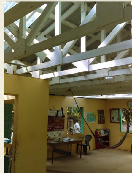
Improved roof at MBNP