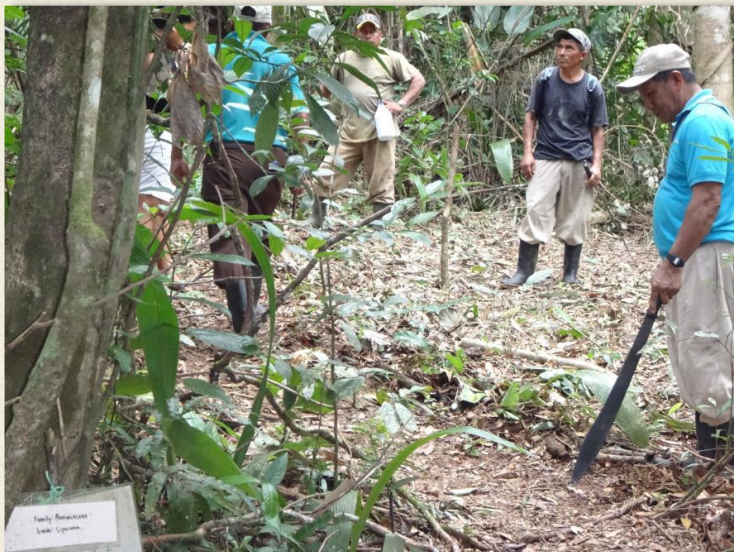
Community members and the board of RBMA constructing the medicinal trail