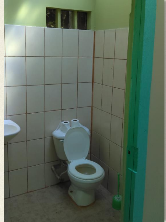
Restroom at CBS (left) and MBNP (right)